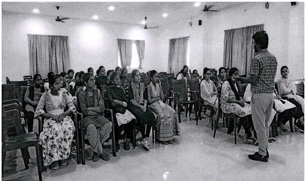
Participant attain programme of “Carrier Opportunities in different sector” for reserved category students